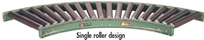
Single roller design